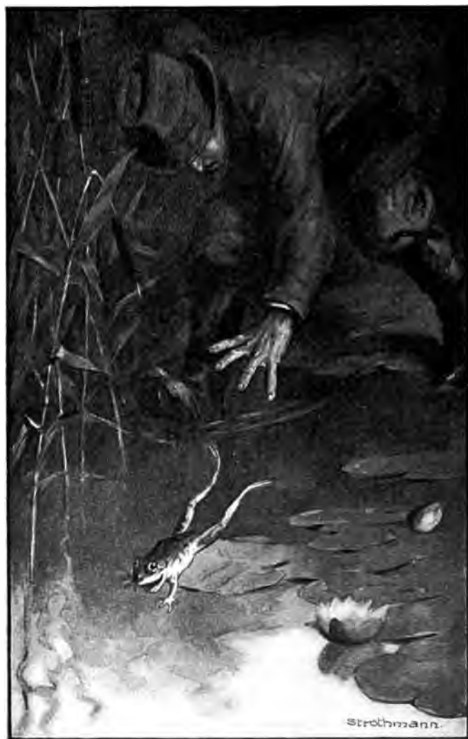
“‘FINALLY HE KETCHED A FROG’”